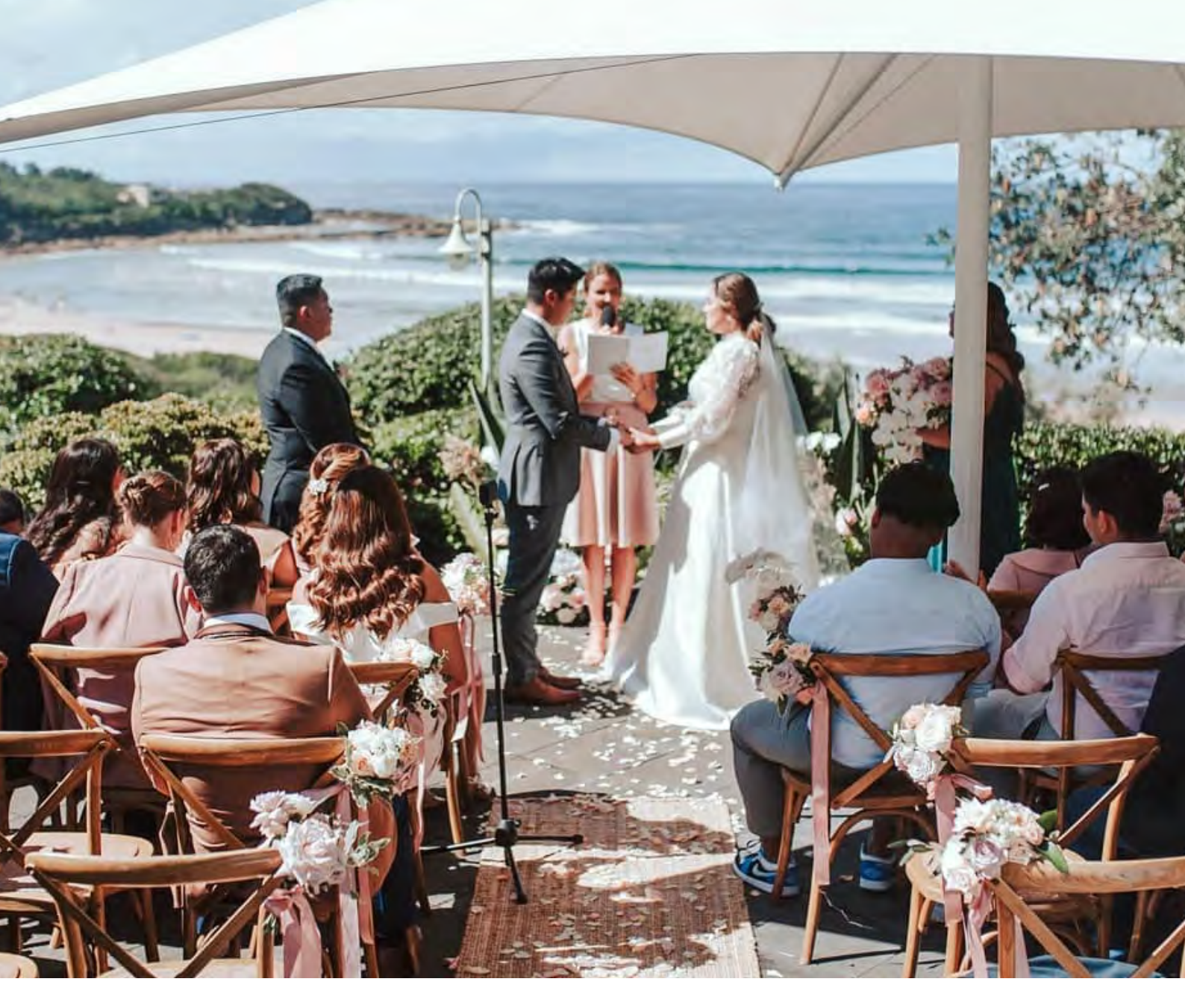
Includes: 24 timber garden chairs | signing table | jute runner | wet weather back up

Our beautifully landscaped garden, overlooking the beach is available for your private ceremony. Additional charge $700.